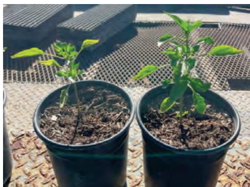
Phytamin Pure at different application rates